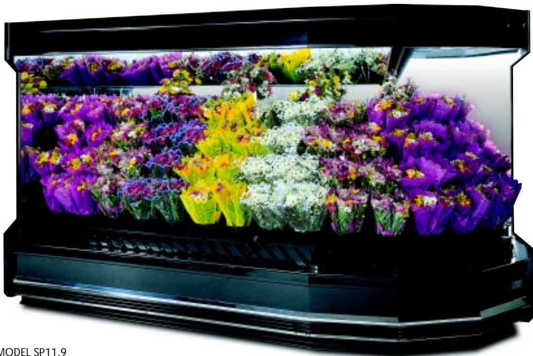
MODEL SP11.9 with Top Shelf (Right Corner)

FLORALWALL™ SP Corner series Natural environment floral refrigeration units